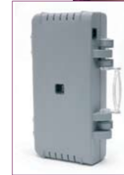
Brite-Box Brite-Box Sun Stimulator 410D-Lux £199.00