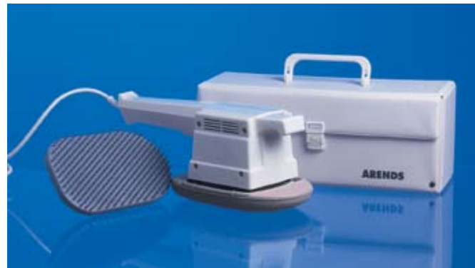
100.10.000 AW Medex large surface area massager £175.00