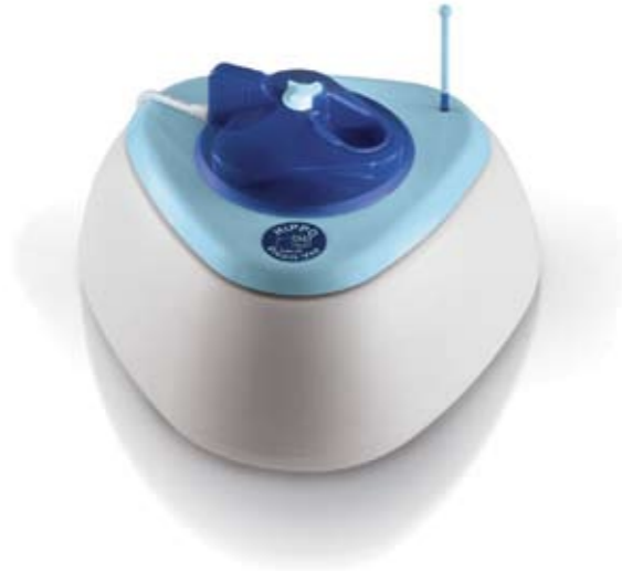
120.50.000 Hippo Humidifier £54.00