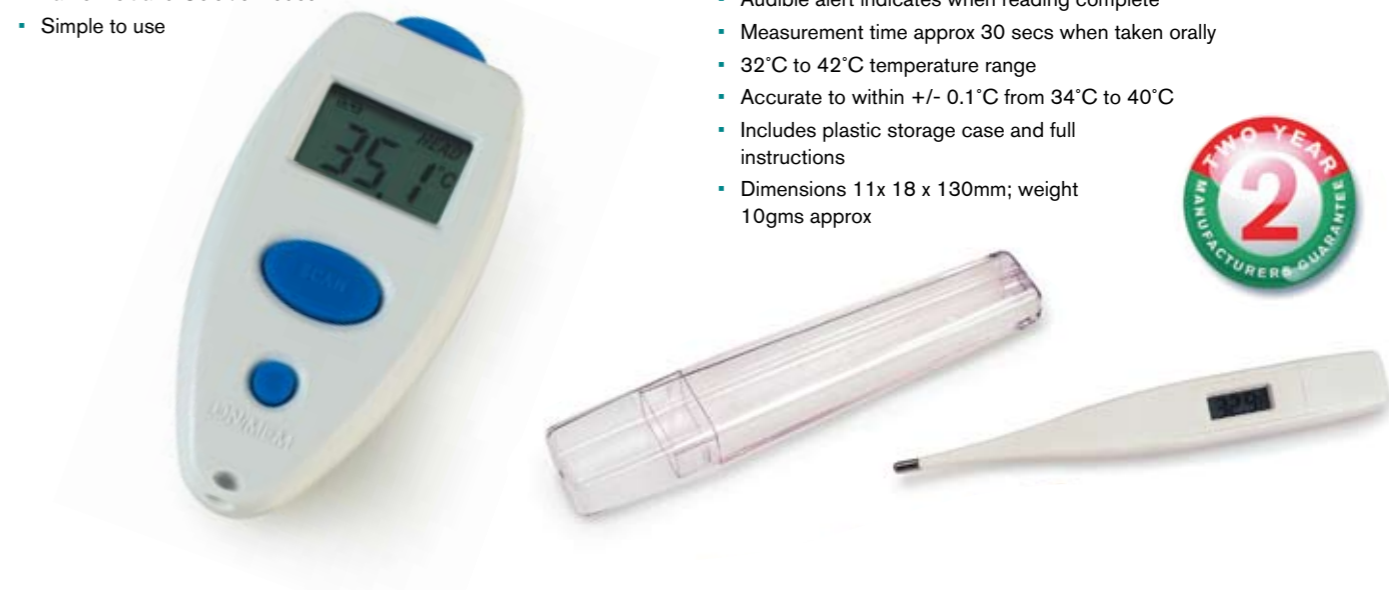
96.28.000 AW InfraRed Forehead Thermometer £23.00